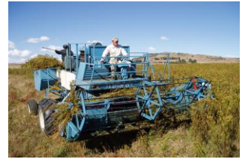
Tagete are harvested with a transformed wheat harvester