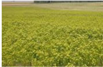
Middle of April Full in flower