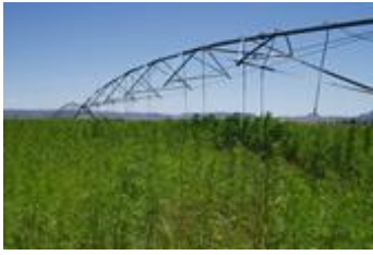
Middle of March- flower Start harvesting