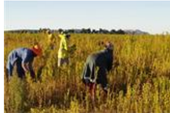
Highland Essential Oils also buy Tagete from jobless locals harvesting it in the wild and bringing it to the factory