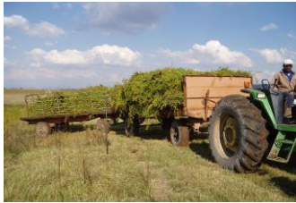
Transport to Factory